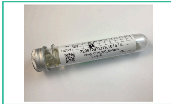
The photo on this report is of a sample collected by the lab and may vary from the final packaging

Test performed via Hardy chromogenic dry and agar plates. ND = Non Detect; LOQ = Limit of Quantitation; Tested Microbial Endpoints: Total Viable Aerobic Bacteria, Total Yeast and Mold, Total Coliforms, Enterobacteriaceae, Aspergillus (flavus, fumigatus, niger and terreus), E.coli pathogenic strains, and Salmonella spp. Microbial testing performed per SOP-000004 Method. LOQ has been set to the Limit of Detection (LOD) / Method Detection Limit (MDL) for all endpoints.