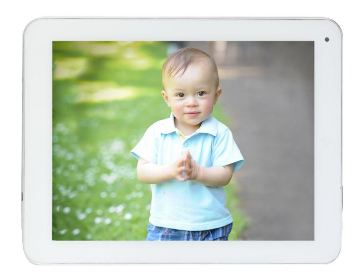
Android 4.2 8" Tablet User Manual Model: 80D8W