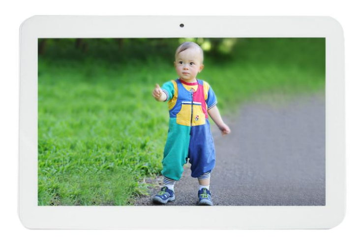
Android 4.1 10" Tablet User Manual Model: 10Q-8