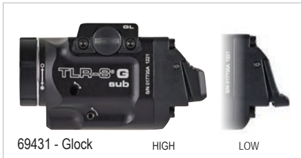
69431 - Glock