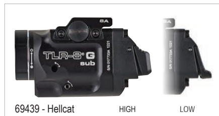
69439 - Hellcat