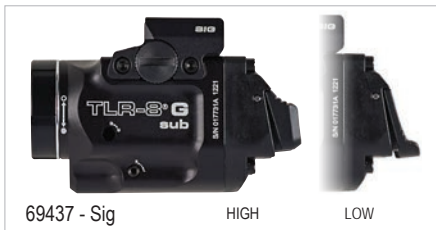
69437 - Sig