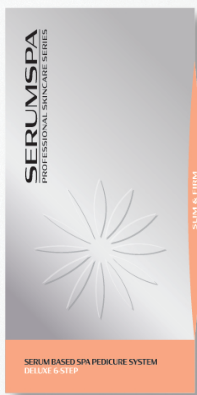
SLIM & FIRM