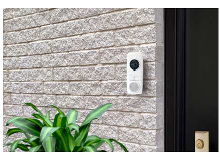
DB7 angle mount bracket