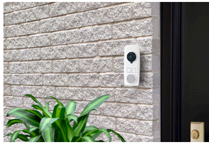
DB7 angle mount bracket