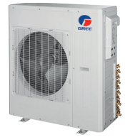
36K & 42K BTU/hr condensing units