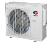
18K, 24K & 30K BTU/hr condensing units