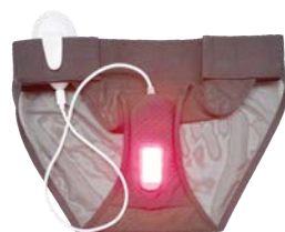
*NeoBrief sold separately