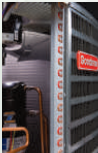
Goodman's SMARTCOIL™ 5mm tube condensing coil design optimizes the heat transfer ability of R-410A refrigerant compared to standard 3/8" copper tubing.

We know that the last thing you want to hear at night is a noisy air conditioner starting up. So, we build our Goodman brand GSX16 Air Conditioners with sound-dampening features that help ensure that your cooling system doesn't interfere with a good night's sleep. We rely on a quiet condenser fan system and a unique louvered sound-control top – to reduce fan-related noise. Your Goodman brand GSX16 Air Conditioner will keep your home cool and comfortable, year after year.