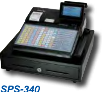
Flat, Spill-Resistant Keyboard; Receipt and Journal Printers