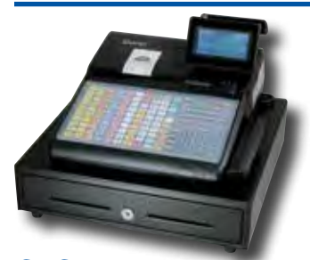
SPS-320 Flat, Spill-Resistant Keyboard; Receipt Printer