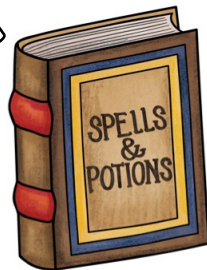
Table of Contents: Vocabulary Packet