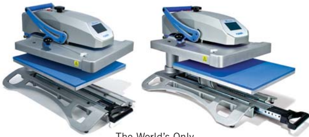
The World's Only Swinger/Draw Design