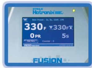
Exclusive Touch Screen Technology