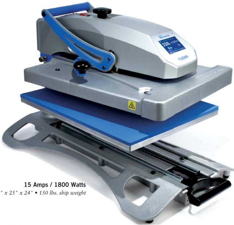
15 Amps / 1800 Watts 37" x 25" x 24" • 150 lbs. ship weight