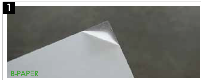
1 Peel off a corner of the white backing paper from the B-Paper and fold it over.

The B-Paper has a matt and glossy side. The matt side is the backing paper and it will be disposed of after peeling it off from the foil.