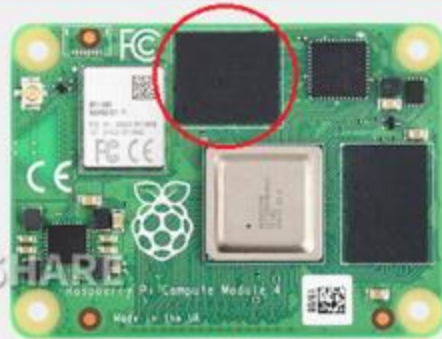
CM4 with eMMC and WiFi