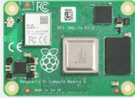
CM4 Lite with WiFi