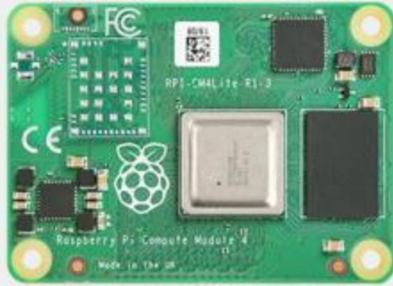
CM4 Lite without WiFi