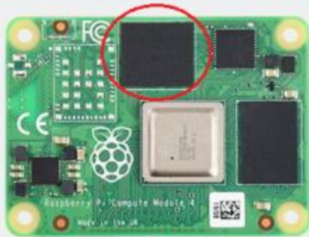
CM4 with eMMC, without WiFi