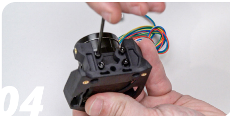
04 Insert the four M3x14 SHCS screws and tighten them