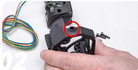
02 Insert the PTFE coupler in the LGX lite mount