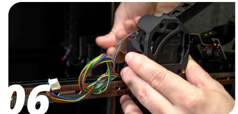
06 Tighten the two screws holding the extruder to your x-carriage.