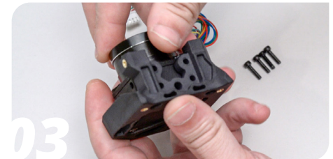
03 Take the LGX lite and place it in the mount