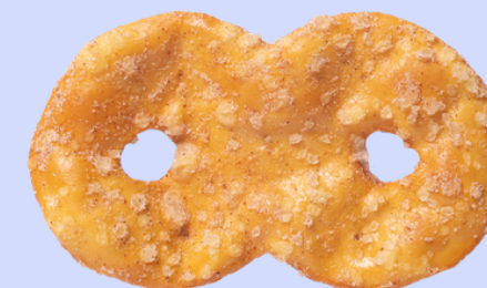
Cinnamon Sugar Infinity Thin