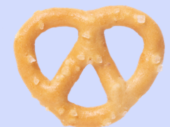
Gluten Free *Available in all shapes & sizes