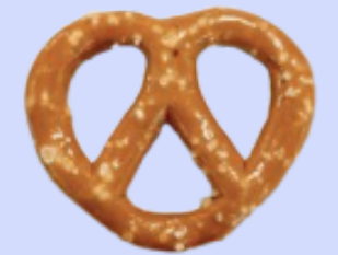
East Coast Style *Available in all shapes & sizes