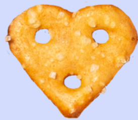
Mini Heart Thin