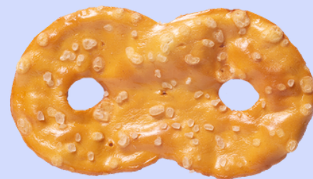
Sea Salt Infinity Thin