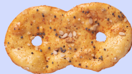
Everything Seasoning Infinity Thin