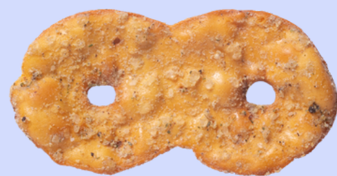
Garlic Parmesan Infinity Thin