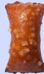
Almond or Sunflower Butter Filled Pretzel