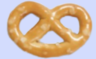
Whole Wheat *Available in all shapes & sizes