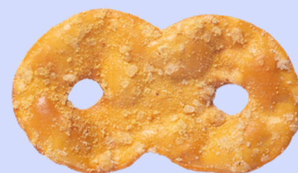
Honey Mustard Infinity Thin