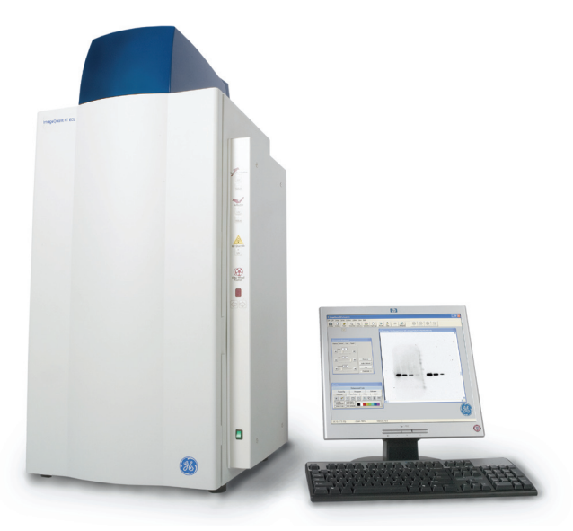
Fig 1. ImageQuant RT ECL imager.

The imager can be controlled manually or with a PC using ImageQuant Capture software. The FrameGrabber feature enables capturing several exposures of a membrane or gel at different time points. Image analysis is performed using ImageQuant TL software.