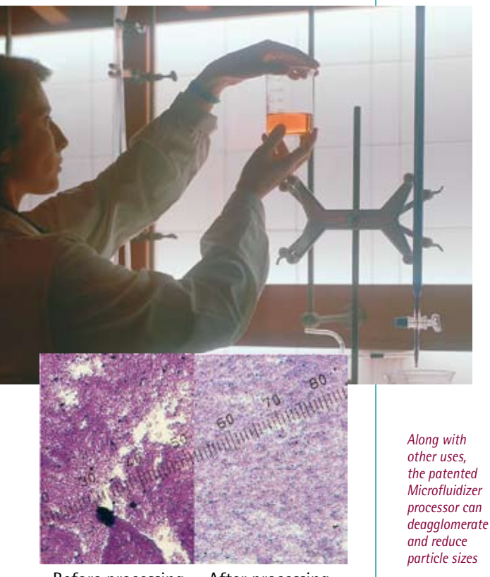
Before processing After processing

Microfluidics produces patented Microfluidizer processor equipment with high-pressure, fixed-geometry interaction chambers that impart intense energy to product formulations. The M-110S produces up to 23,000 psi with standard lab air, for premium results at an affordable cost.