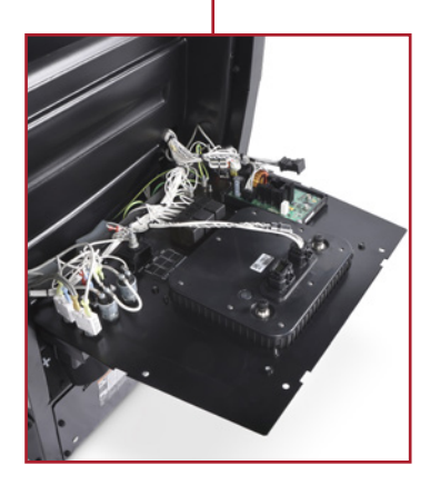
Coated, strain-relief wiring harnesses help connections last longer