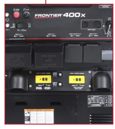
Encapsulated GFCIs designed for improved reliability to reduce nuisance tripping and allow quick replacement in the field