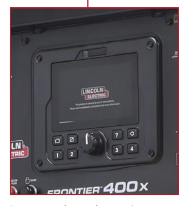
Impact and weather resistance design with anti-glare screen to stand up to harsh field conditions