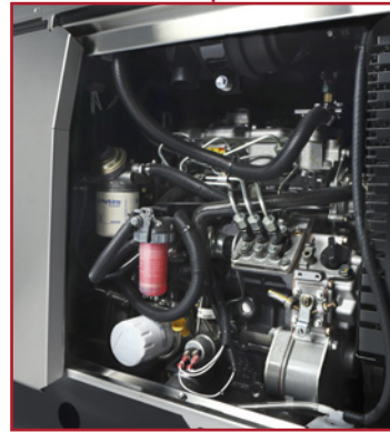
Removable slide-access door for easy access to the engine and oil drain valve for quick oil changes