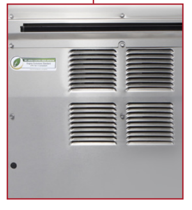
Stainless steel and painted external sheet metal provides extra protection and corrosion resistance