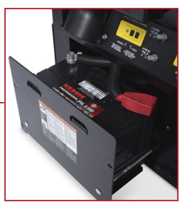
Sliding battery tray enables easy access to the battery