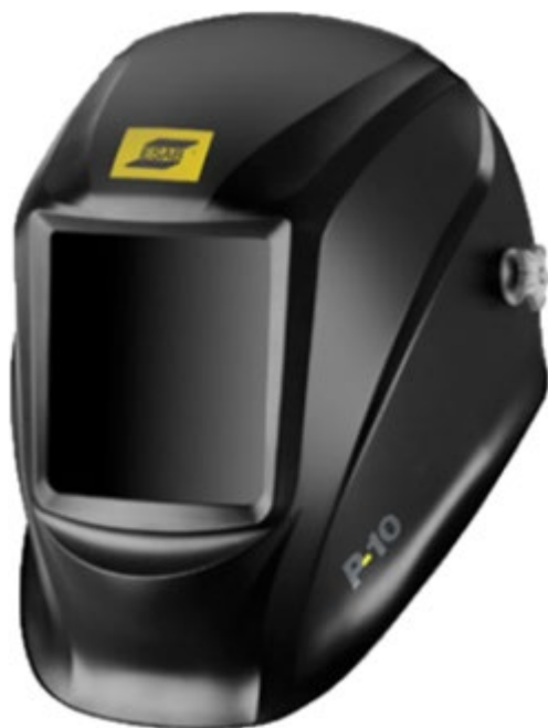
ESAB P-10 Passive Shade 10 Welding Helmet