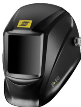
P-10 passive helmet front view