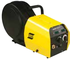
Warrior Feed 304