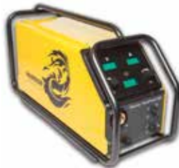
Warrior YardFeed 200