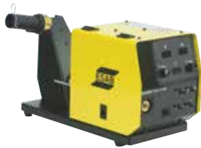
Warrior Feed 404HD