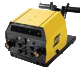
Warrior Feed Dual 304