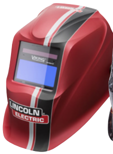
VIKING™ 1740 ReCode™ K3495-3