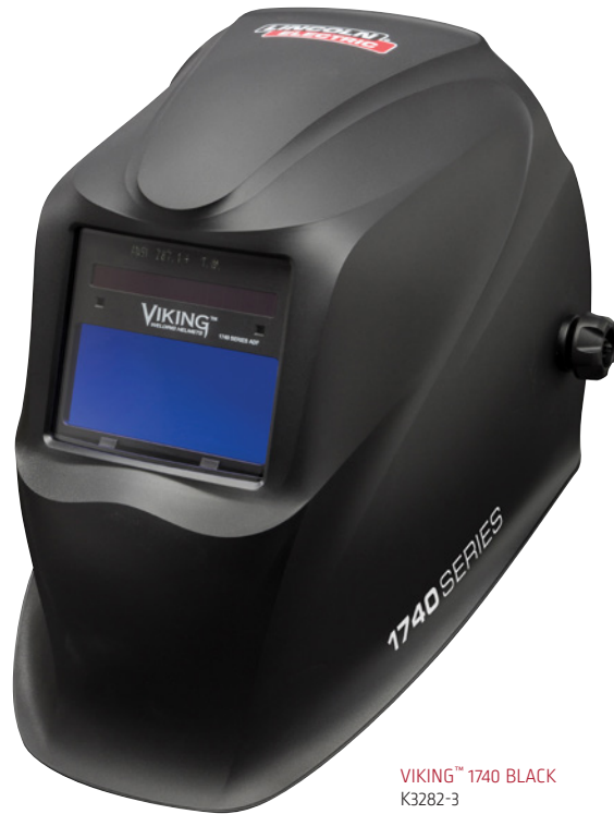
VIKING™ 1740 BLACK K3282-3