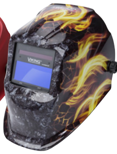
VIKING™ 1740 Ignition™ K4375-3