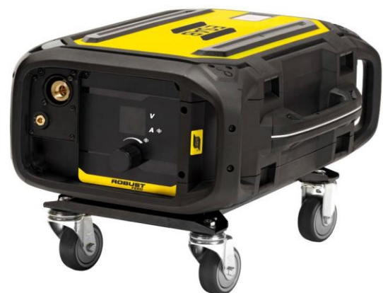
Wheel Kit works with feeder horizontal or vertical