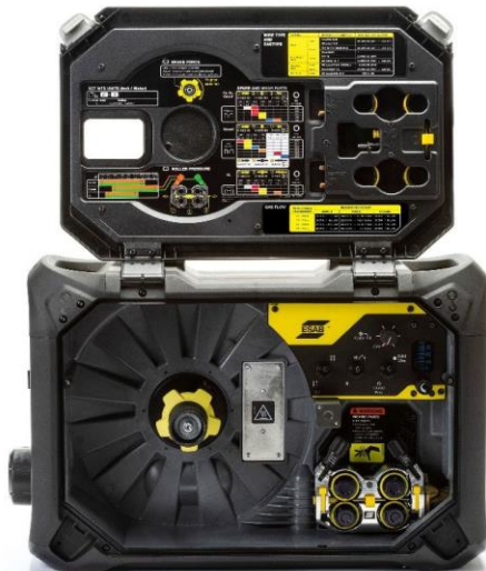
Internal LED lights and integrated storage for wear parts in lid