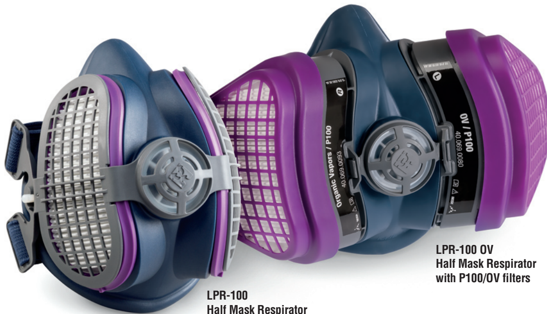
LPR-100 Half Mask Respirator with P100 filters