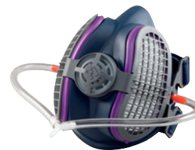
Quantitative Face-Fit Test Kit shown installed on LPR-100