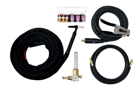
301268 kit shown.