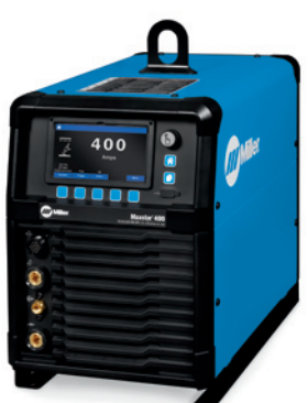
Maxstar 400 machine only

Allows for any input voltage hookup (208-600 V) with no manual linking, providing convenience in any job setting. Ideal solution for dirty or unreliable power.