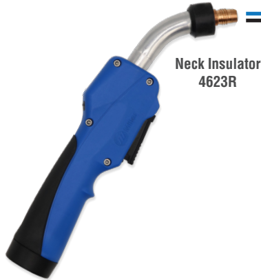
Neck Insulator 4623R