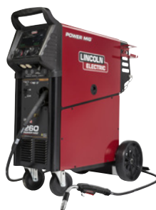
POWER MIG® 260 K3520-1 MSRP $3,899 | $500 MFG REBATE $3,399 After Rebate