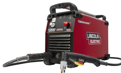
Tomahawk® 1000 K2808-1 MSRP $3,517 | $500 MFG REBATE $3,017 After Rebate