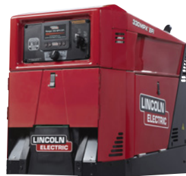
Ranger® 330MPX™ EFI K4779-1 MSRP $9,449 | $1,000 MFG REBATE $8,449 After Rebate

**Qualifying Stack and Save products are Lincoln Electric accessories and filler metals. Excludes welders and plasma cutters. Stack & Save offer only available with purchase of rebated machines. Only one Stack & Save rebate per receipt/invoice. Qualifying purchases must be made at Lincoln Electric authorized U.S. Distributors only. Rebate offers effective January 1 - June 30, 2024. Offers available only to end users, while supplies last, and may be discontinued at any time. Price is based on current MSRP, which is subject to change. Total price to end user determined by actual sales price. Purchase may be subject to additional taxes and fees. Available at Lincoln Electric Authorized U.S. Distributors only. Contact a Lincoln Electric representative for current promotion status. Rebate claim forms must be submitted within 30 days of purchase by end user.