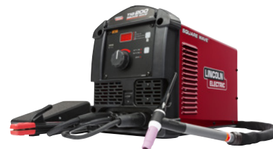
Square Wave® TIG 200 K5126-1 MSRP $2,399 | $600 MFG REBATE $1,799 After Rebate