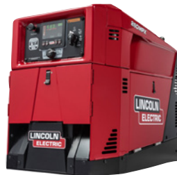
Ranger 260MPX K3458-1 MSRP $7,139 | $700 MFG REBATE $6,439 After Rebate