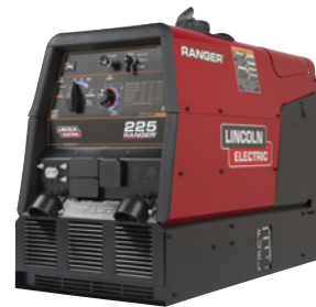
Ranger 225 K2857-1 MSRP $5,999 | $700 MFG REBATE $5,299 After Rebate