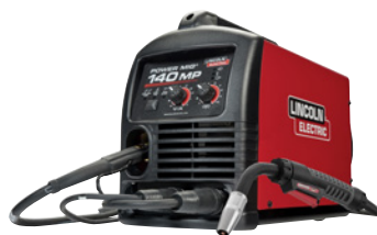
POWER MIG 140 MP** K4498-1 MSRP $969 | $100 MFG REBATE $869 After Rebate