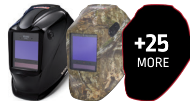
All VIKING™ 2450, 2450 ADV 3350 & 3350 ADV Series Welding Helmets $75 MFG Rebate