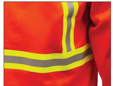
FR Triple Trim Reflective Tape allows wearer to be more easily seen