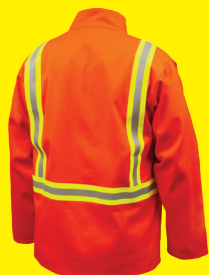
JF1010-OR Safety Orange