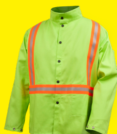
JF1010-LM Safety Lime