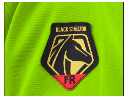
Easy ID FR Patch allows quick identification of a protective garment

©2020 Revco Industries, Inc. dba Black Stallion Industries, Inc. V01.2021JAN