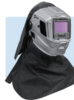
Optional heavy-duty head seal provides additional protection with an APF of 1,000.