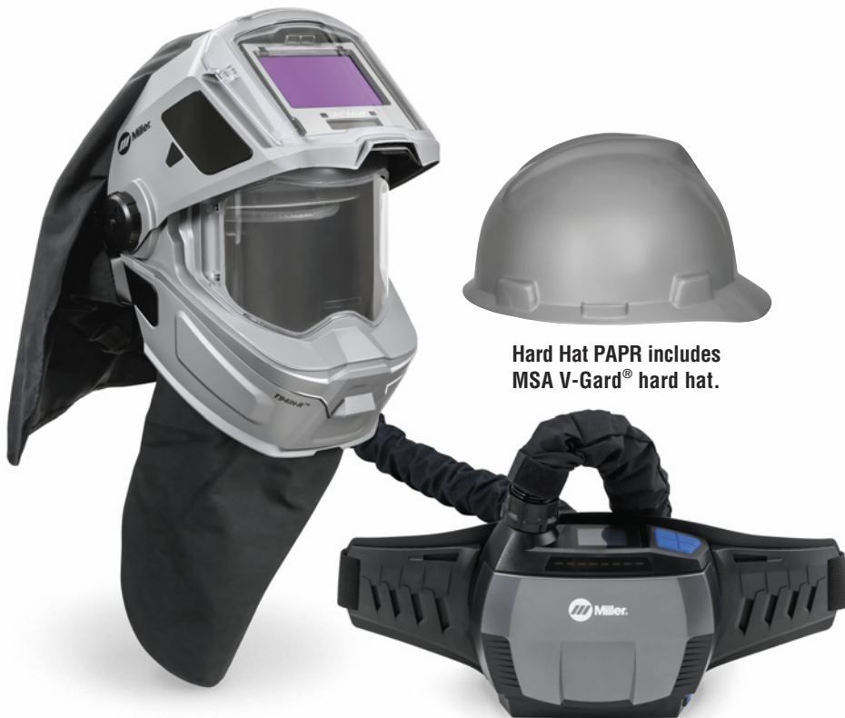
Hard Hat PAPR includes MSA V-Gard® hard hat.