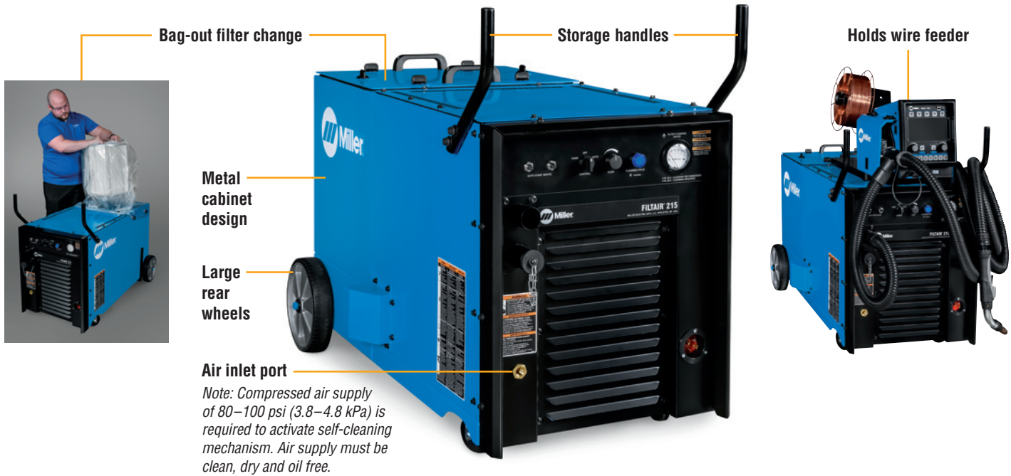
Filter cleaning gauge