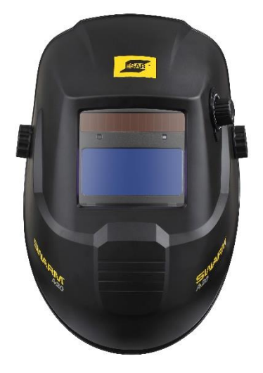
Lightweight, streamlined shell design with 1/1/1/2 CE optical clarity.