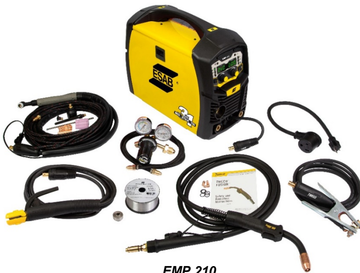
EMP 210 Multi-Process MIG/Stick/DC TIG Welding System Package

ESAB EM 210 and EMP 210 inverter-based welding systems are ready to tackle steel, stainless and aluminum projects. Featuring professional-grade arc characteristics and full-featured digital controls which enable fine-tuning of the arc performance to deliver superior welds. Both systems weight just 29 lbs. and offer dual-voltage 120/230V flexibility. Take these welders wherever work takes you – around the shop, in the field or at home in your garage.