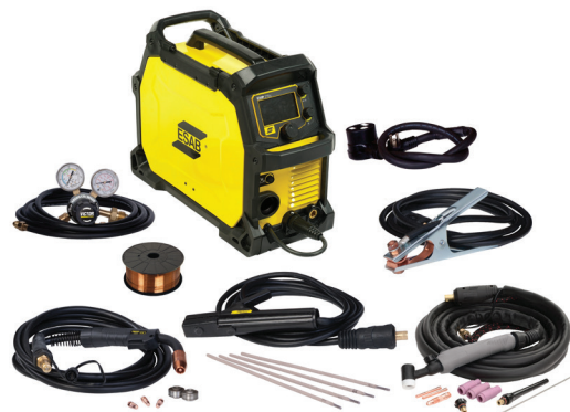
Rebel EMP 215ic complete package.

When choosing a top-performing welding machine you need top-performing ESAB Filler Metals. Learn more at esab.com/fillermetals today.