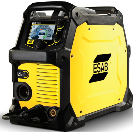
Rebel EMP 215ic