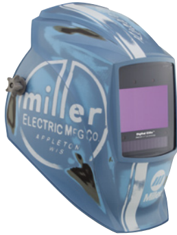
Vintage Roadster™ 289764