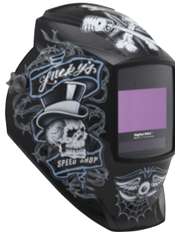
Lucky's Speed Shop™ 289756