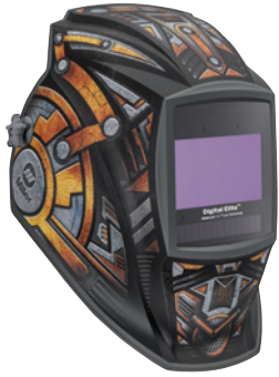
Gear Box™ 289844