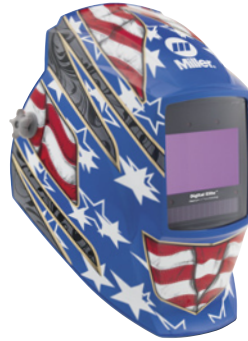
Stars and Stripes™ III 289759