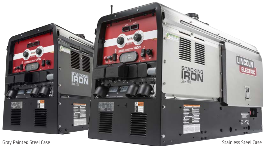
Gray Painted Steel Case [Base Model] K4166-1

It all comes in a compact, lightweight package that will fit into any truck bed and give you plenty of visibility through the rear window.