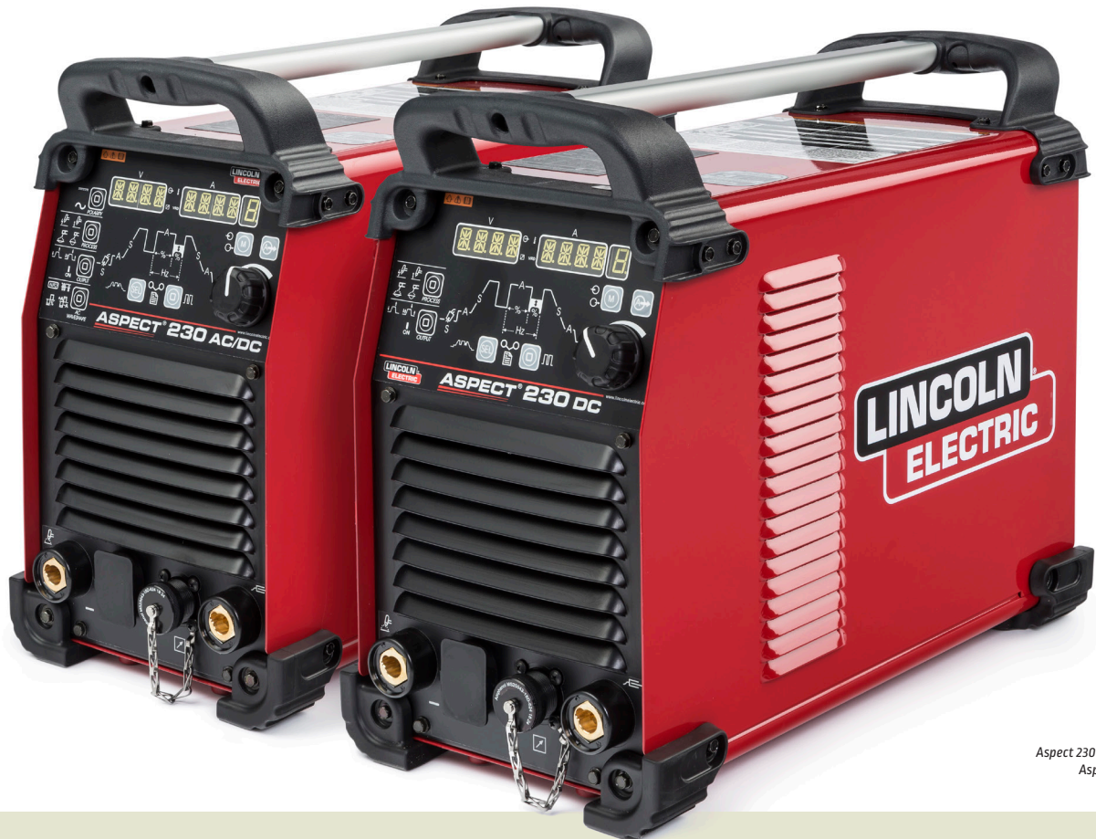
Shown: Aspect 230 AC/DC (K4340-1) and Aspect 230 DC (K4346-1)

THE CONSISTENCY YOU WANT, THE PERFORMANCE YOU NEED.