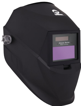
Black (VS) 287803