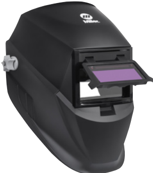
FS#10 Flip-Up 287798