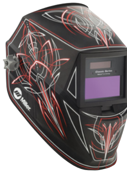
Rise™ (VS) 287815