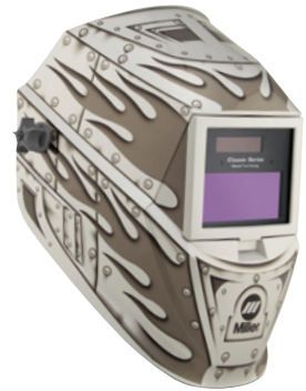
Metalworks™ (VS) 287810