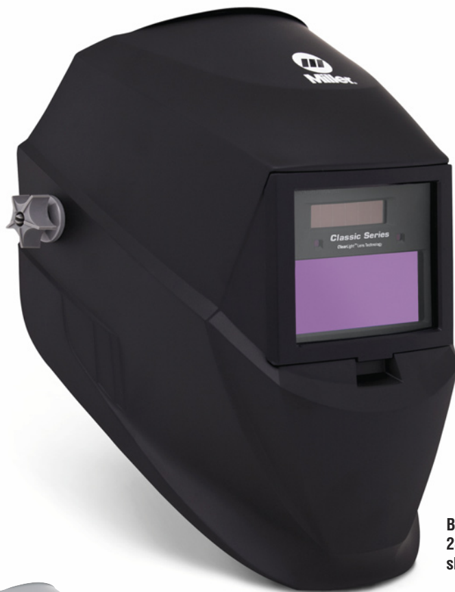
Black (VS) 287803 shown.

FS#10 Flip-Up: 14 oz. (396 g) VS: 16 oz. (454 g) VSi: 23 oz. (652 g)