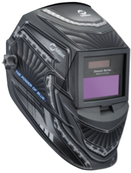
Metal Matrix™ (VS) 288519