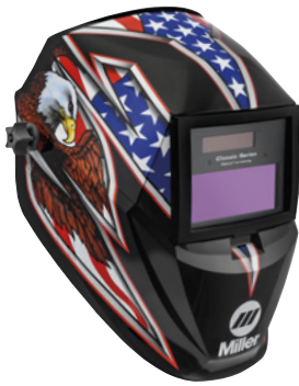
Liberty™ (VS) 287820