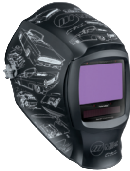
'22 Custom Kindig-it 292933