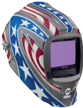
Stars and Stripes™ 288420