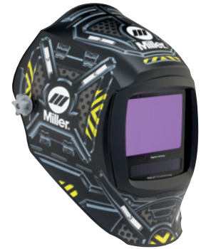
Black Ops™ 289715