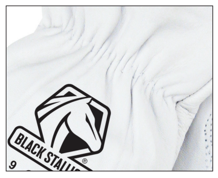
Shirred Elastic Wrist offers a more snug and more comfortable fit