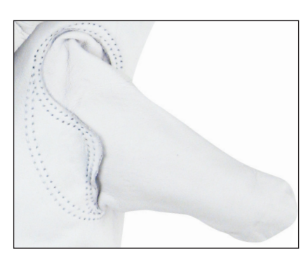
Ergonomic Keystone Thumb maximizes articulation and hand control