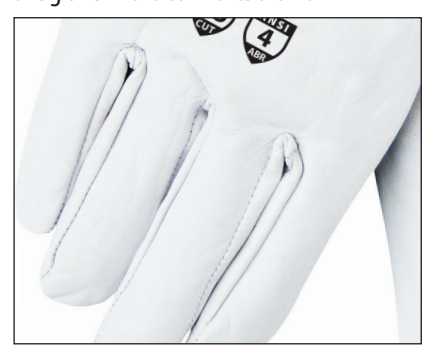
Inside Seam Construction protects threads from wear and abrasion