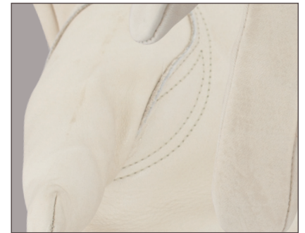
Ergonomic keystone thumb maximizes flexibility