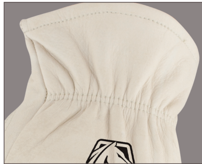
Shirred elastic cuff offers a snug fit