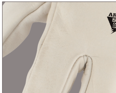
Inside seam construction protects threads