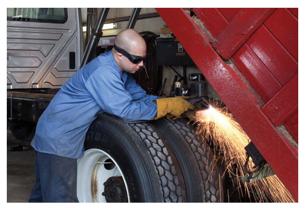
Vehicle repair and modification