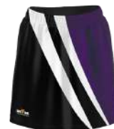
EXPRESS > SKORT-04