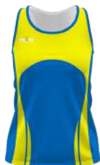
POCKET > NSS-02