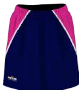
OVERLAP > NSS-03

Forrest, Gold, Red, Navy, Royal, Black, Grey, Red, White, or choose/design your own.