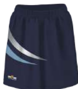
FLOW > SKORT-01

Forrest, Gold, Red, Navy, Royal, Black, Grey, Red, White, or choose/design your own.