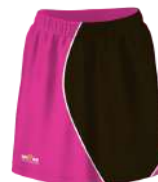
SCOOP > SKORT-03