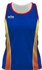
OVERLAP > NSS-01

Forrest, Gold, Red, Navy, Royal, Black, Grey, Red, White, or choose/design your own.