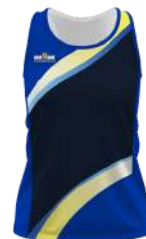
DICTATE > NSS-03