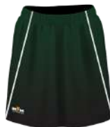
POCKET > NSS-04