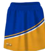
DICTATE > NSS-05