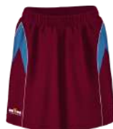
TEAM > SKORT-02