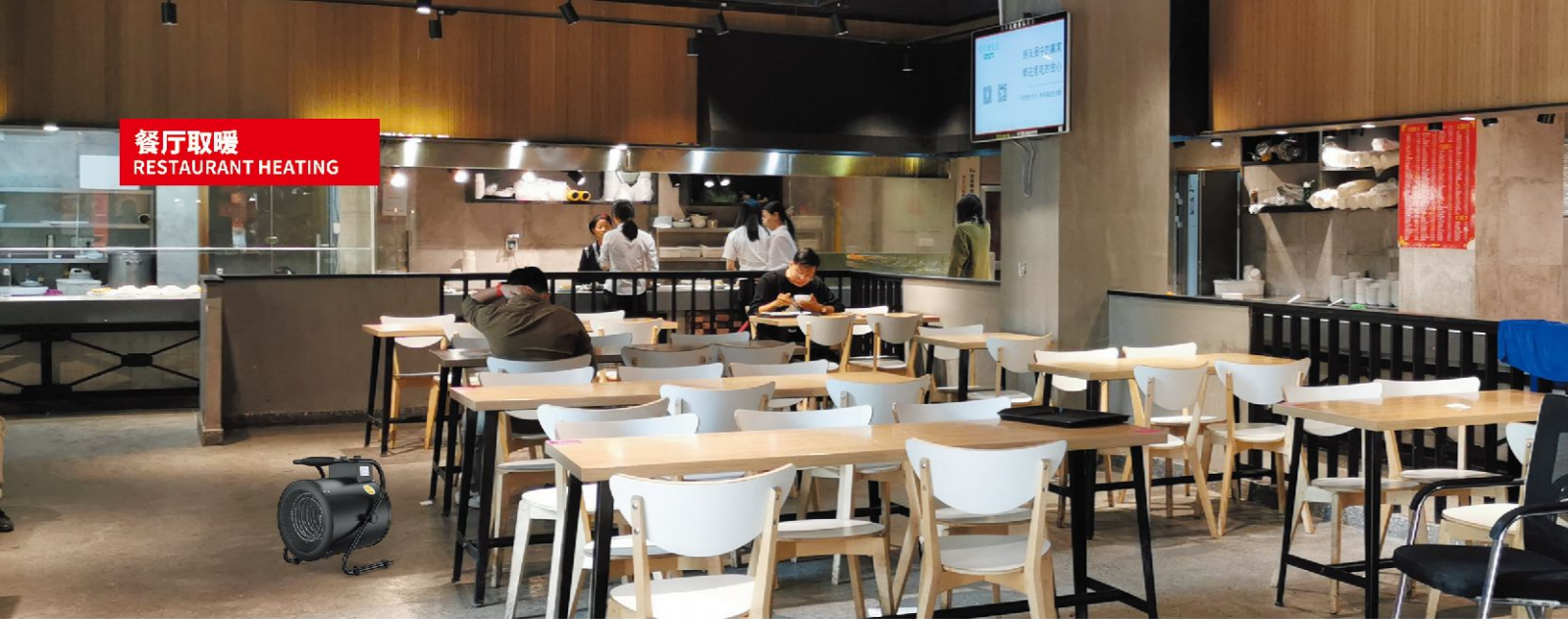
餐厅取暖 RESTAURANT HEATING