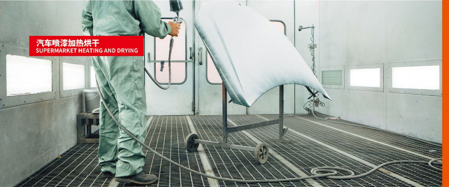
汽车喷漆加热烘干 SUPERMARKET HEATING AND DRYING