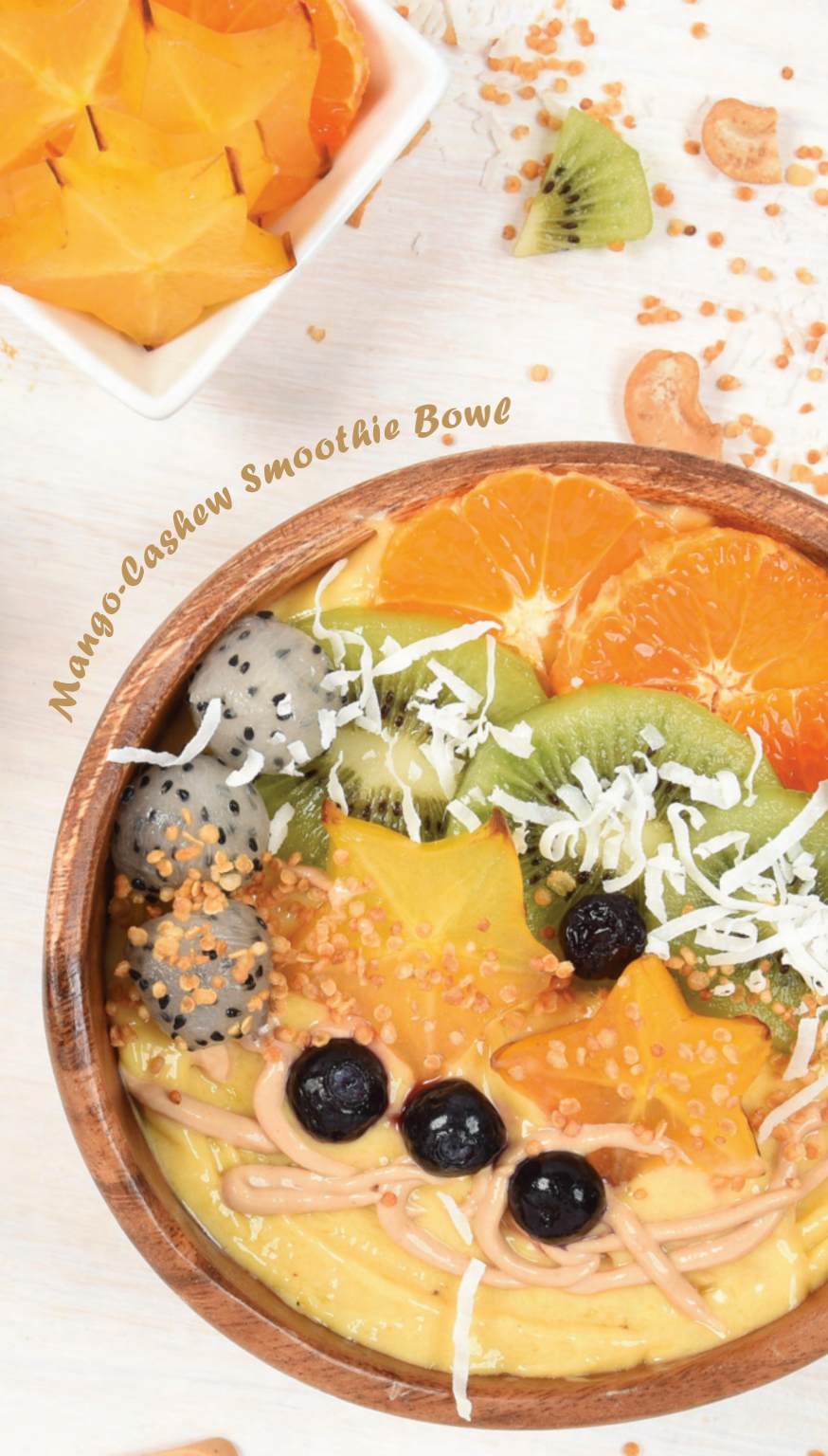
Mango-Cashew Smoothie Bowl