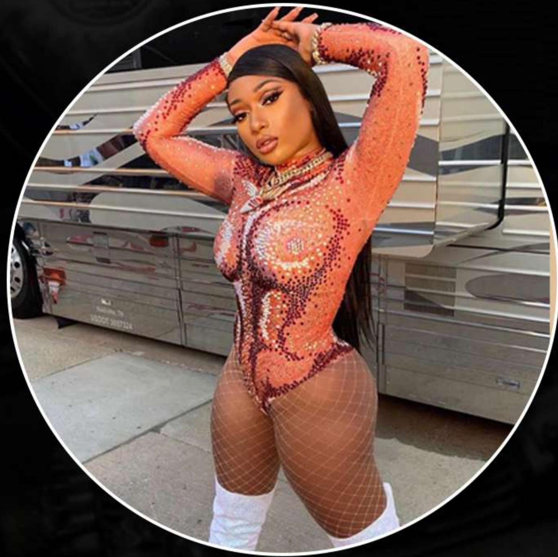
MEG THE STALION