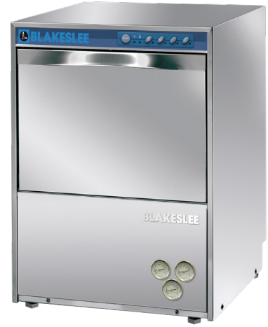
UC-18-1 / UC-18-3