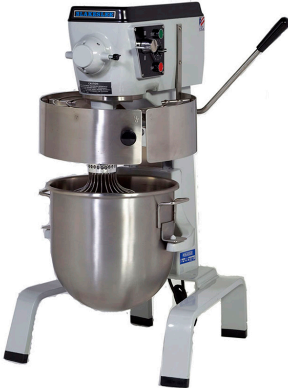
F-20-CA / F-20-SS

Blakeslee Planetary Mixers are available in 20, 30, 40, 60, and 80 quarts in either stainless steel or cast aluminum. Blakeslee planetary mixers are engineered with an agitator that attaches to a rotating shaft, while the mixing bowl remains stationary. Interchangeable accessories / attachments allow the end user to consistently mix ingredients. Planetary mixers are available in 2, 3 and 4 speed transmissions and perform flawlessly.