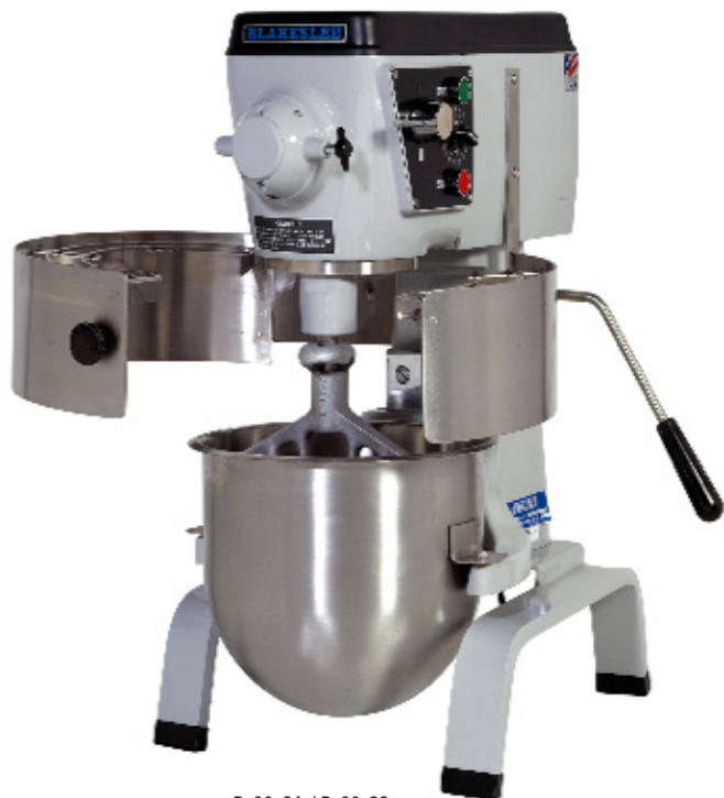
B-20-CA / B-20-SS

Blakeslee 20 quart bench mounted mixers combine good looks with ultra efficiency. The B-20 line features a modern, streamlined design with superior craftsmanship and trouble-free operation. The three speed, gear-driven planetary mixing action mixes all ingredients in the mixing bowl. The auxiliary drive operates the optional attachments. The simple construction means less work and better food preparation, as well as, exceeding sanitary standards and ease-of-cleaning. A big plus for your kitchen!