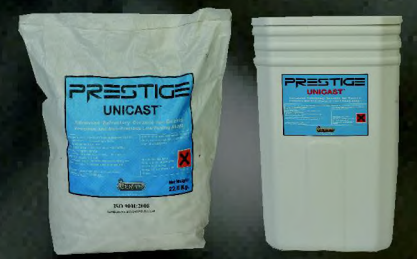
Unicast comes in 22.5kg. Plastic lined Poly Sacks or 45kg. Heavy duty reusable Plastic Drums for containment of used investment

• Allow to sit undistributed for 90-120 minutes before burnout